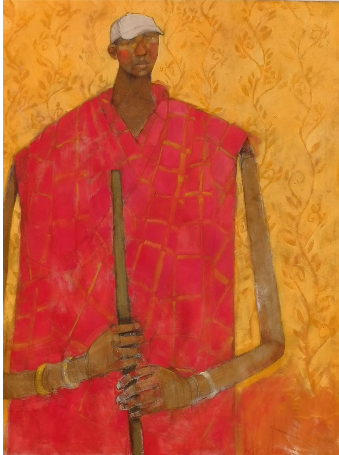
YOUNG MAASAI HERDER | 2019 121,5cm H x 91cm W | Oil on canvas - ENQUIRE