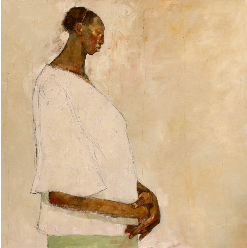
Gachie Profile on White | 2018 | 92cm x 92cm | Oil on canvas – Contact for price