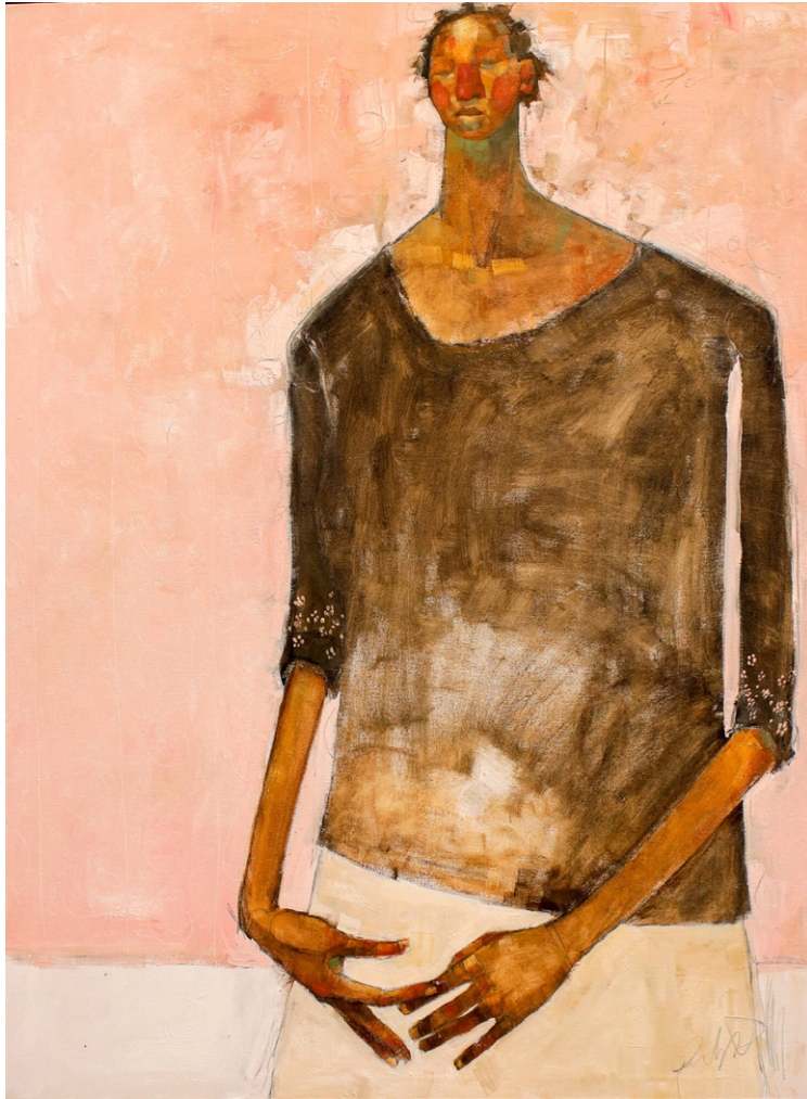
Woman on Pink | 2018 | 122cm H x 93cm W – Oil on canvas – Contact for price