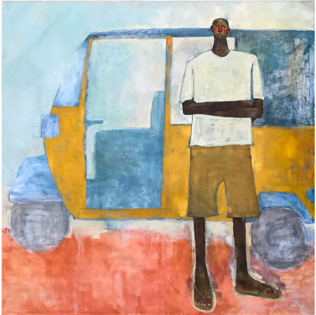
Tuk Tuk | 2020 | 183cm x 183cm | Oil on canvas - Contact for price