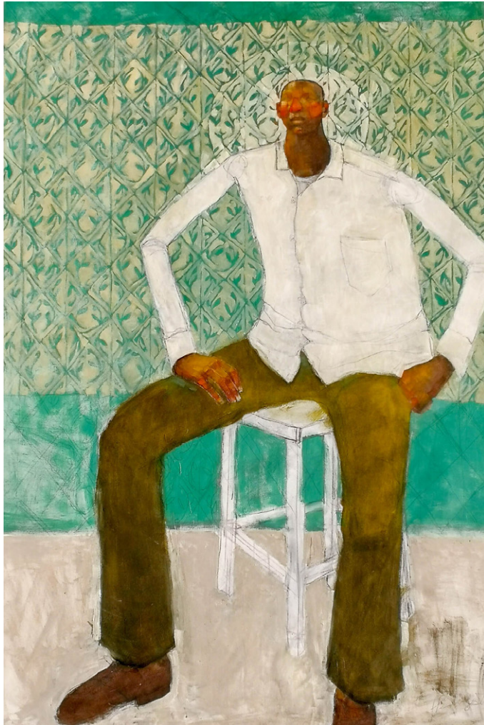
Man sitting with Aura | 2019 | 183cm H x 122cm W | Oil on canvas – Contact for price