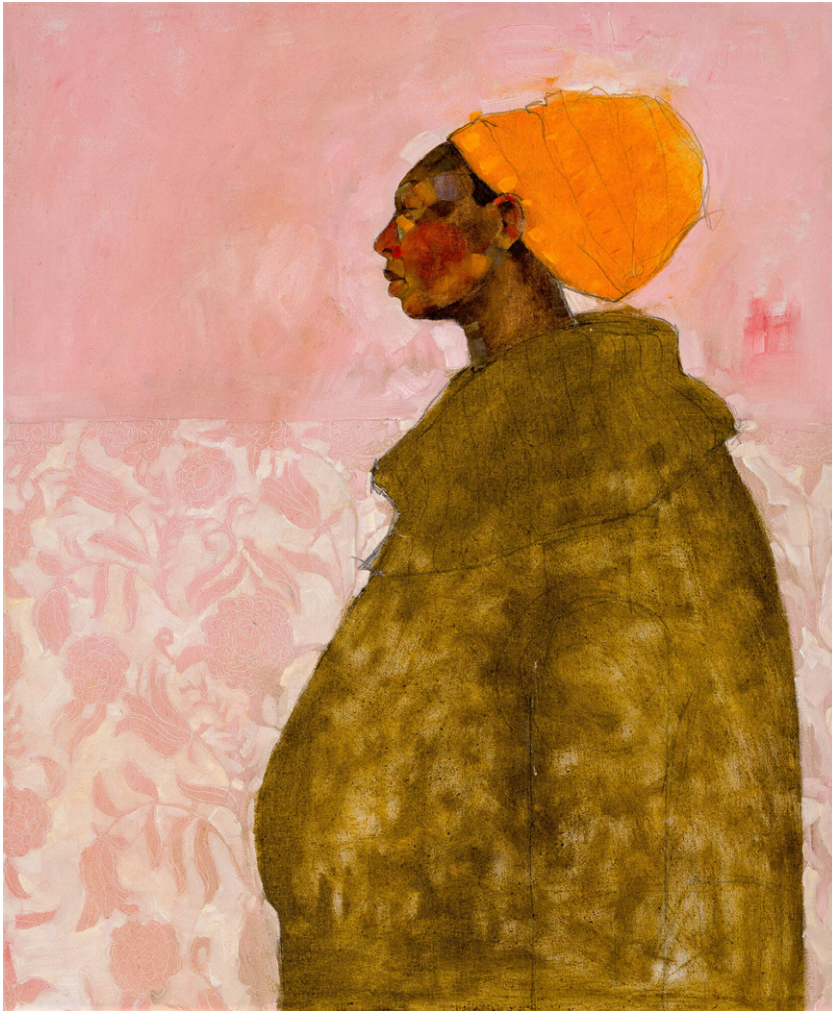
Lucy on Pink | 2018 | 92cm H x 75cm W | Oil on canvas – Contact for price