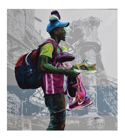
Le Chasseur du Soir – 2022 118cm H x 110cm W – Acrylic on canvas Price: 9,000USD / 9.000€ / 8,100pounds

And yet, in spite of this, the most obvious point in Onguene's work is that his subjects are still managing, and in some cases possibly even thriving, in these circumstances. The welcome pop of warm, vibrants colours, and in some portraits, the smiles of his subjects, is indicative of an optimism, courage and hope that offers a promising counter narrative to the current state of turmoil and decline.