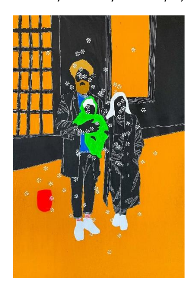
La Famille X – 2022 150cm H x 100cm W – Acrylic and ink on canvas Price: 6,500USD / 6.500€ / 5,800pounds