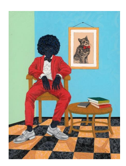
Red Suit – 2022 152cm H x 112cm W – Acrylic on canvas Price: 7,000USD / 7.000€ / 6.300pounds