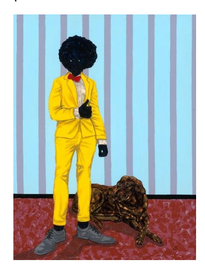
Yellow Suit – 2022 152cm H x 112cm W – Acrylic on canvas Price: 7,000USD / 7.000€ / 6.300pounds

Ronald's work speaks to the spirit of tenacity, hope and optimism in the face of adversity. His signature blue-black skin patchwork and afro and dreadlock hairstyles of his muses, are intentional references to the artist's celebration of being unapologetically black, African, and free, a subtle nod to the influence of the global rastafarian and pan-Africanism movements, and the anti-colonial independence struggle which inspires his practice.