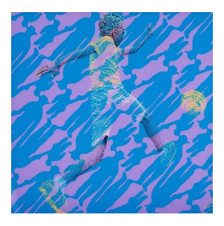
Dream with an eye on the ball – 2018/2022 100cm x 100cm – Oil and acrylic on canvas Price: 8,000USD / 8.000€ / 7,200pounds