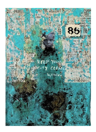
Talking Walls 86 – Keep your city clean – 2019 145cm H x 110cm W – Mixed media on canvas Price: 6,500USD / 6.500€ / 5,800pounds