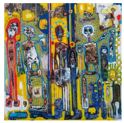
Restore Memory 1 – 2022