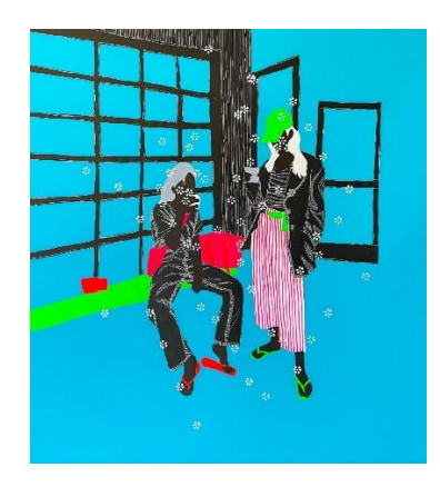
Le cocktail - 2022 140cm H x 130cm W – Acrylic and ink on canvas Price: 8,500USD / 8.500€ / 7,600pounds

Through his work, Moustapha explores and conceptualises his very own idealised and idyllic contemporary world, reminiscent of the golden age of the garden of eden before the fall of man. His portraits form artistic manifestations of his personal values and consciousness are informed by his progressive philosophy of humanism, which is underpinned by a calling for society to lead ethical lives, inspired by his tenets of love, joy, peace, cooperation and happiness.