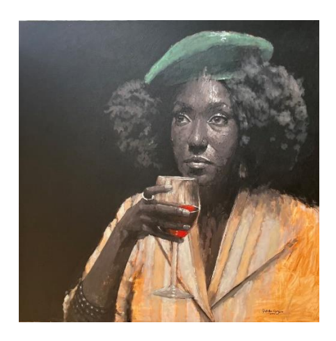
Sip and think – 2022 121cm x 121cm – Acrylic on canvas Price: 10,000USD / 10.000€ / 9,000pounds

Fascinated by human anatomy, Opeyemi's work strives to celebrate the intricacies and fine details of his subjects, from their subtle facial expressions, gestures and mannerism, to their unique habits, emotions and passions. In doing so, the artist manages to capture the essence and spirit of his subjects in a way which transforms his portraits from inanimate to soulful and energetic.