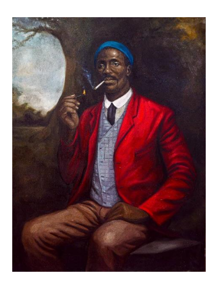
Disguised persona (William Hurley) – 2022 151cm H x 114cm W – Charcoil and oil on canvas Price: 14,000USD / 14.000€ / 12,300pounds