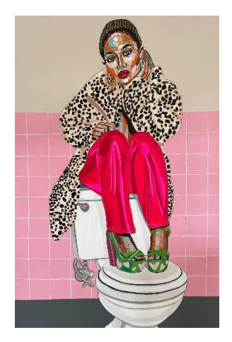
Ekwuzina – Speak no More – 2022 181cm H x 121cm W – Acrylic and ink on canvas Price: 17,000USD / 17.000€ / 15,200pounds (SOLD)

This cultural melting pot has come to be described as 'Afro-politans', or 'Afropeans', and speaks to a growing and increasingly significant section of the African diaspora, whose identities are firmly rooted to Africa, but have clear cultural connections and ties to North America and Europe.