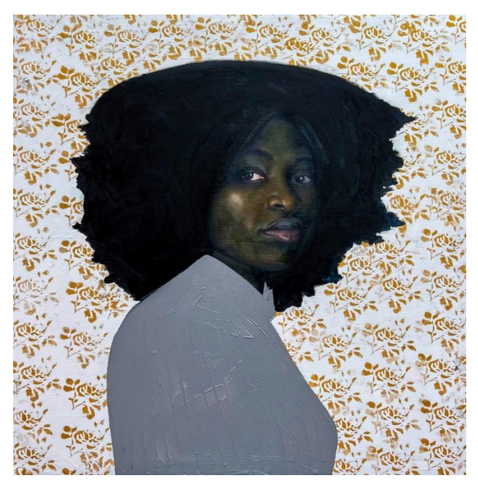
Self Pride – 2022 116cm x 116cm – Oil and acrylic on canvas Price: 85,000USD / 85.000€ / 75,000pounds (SOLD)

For Omofemi, true liberty and emancipation for Africa and black people at large, can only be achieved once, black women are free to be their true selves and celebrated as they are.