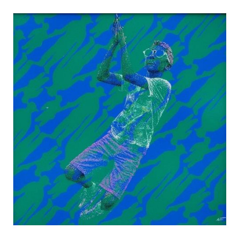
Live life like it's a celebration – 2018/2022 100cm x 100cm – Oil and acrylic on perspex Price: 8,000USD / 8.000€ / 7,200pounds (SOLD)

His bold choices of colours, hot pinks, and lime greens, are a deliberate means of showcasing the confidence, energy, and vibrancy of his subjects; their personalities, character, as well as who they are, and where they are from. Cool and flamboyant in their pose and posture, with their signature sunglasses, Evans strives to showcase the best of the everyday African he captures in his work, highlighting the star quality they each have in them to themselves and to the world.