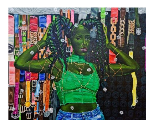
Safety first – 2022 116cm H x 142cm W - Acrylic and silk screen print on canvas Price: 10,000USD / 10.000€ / 9,000pounds

Anjel's work speaks to a modern cultural phenomenon which was conceived in Congo, but has since taken root across the global African diaspora; sapeurism or la sape. Boris' muses not only embraces style and fashion as a means of enjoying the act of dressing well, but for them it is a lifestyle rooted in a philosophy and principles that all must adhere to. Boris, masterfully stamps and weaves indigenous African motifs, such as the adinkra symbols of the Akan people of West Africa, with high fashion labels, to communicate the socio-economic standing of his muses, their association to European wealth and prestige, but also that they are still on par with their ancient African beliefs and customs, and that both can co-exist in harmony.