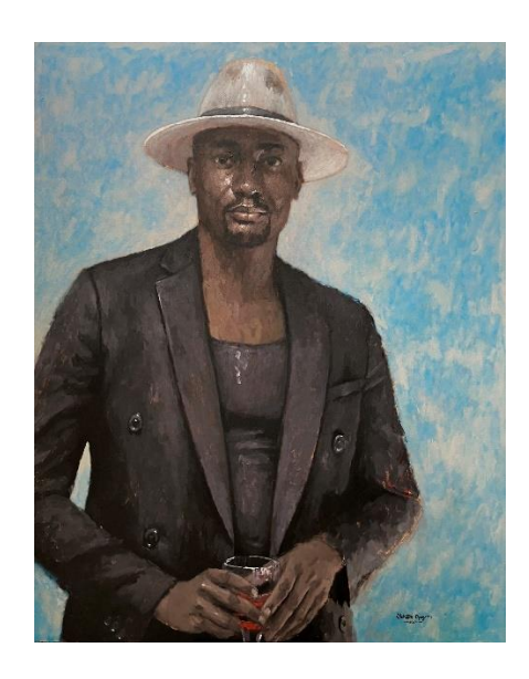
Gentleman II – 2022 152cm H x 121cm W – Acrylic on canvas Price: 12,000USD / 12.000€ / 10,700pounds