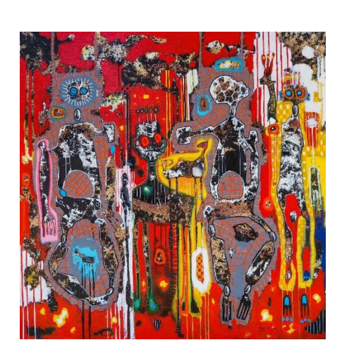
Restore Memory 2 - 2022

Price: 16,000USD / 16.000€ / 14,300pounds