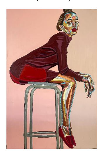
Nekwanu Anya – Look at What I'm Seeing – 2022 179cm H x 116cm W – Acrylic and ink on canvas Price: 17,000USD / 17.000€ / 15,200pounds