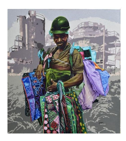
Le Jeune Entrepreneur – 2022 118cm H x 110cm W – Acrylic on canvas Price: 9,000USD / 9.000€ / 8.100pounds