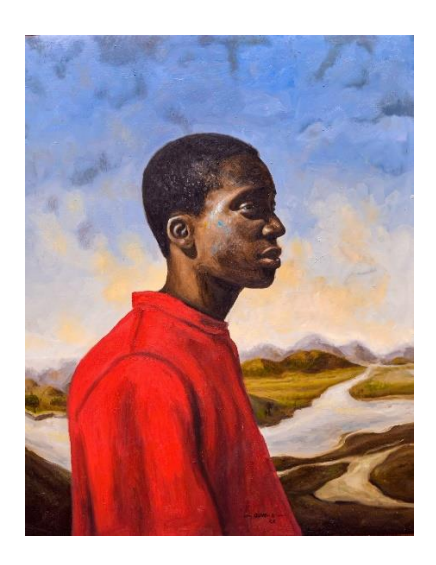
The absence of chaos – 2022 108cm H x 89cm W - Charcoil and oil on canvas Price: 9,500USD / 9.500€ / 8,500pounds

Intrigued by the intricacies of the human figure as a unique work of nature, Oliver draws inspiration from the human form to depict pieces that express his views on issues he believes are neglected and overlooked in society.