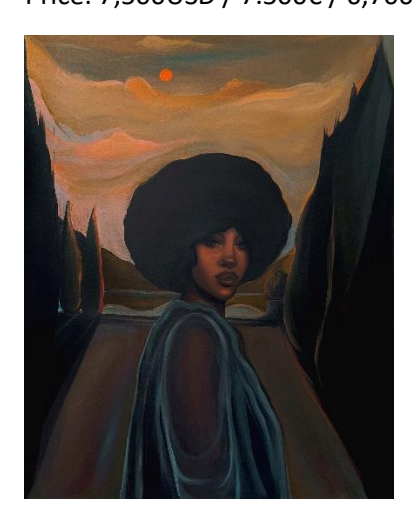
Wanderer 2 – 2022 76cm H x 61cm W – Acrylic on canvas Price: 7,500USD / 7.500€ / 6,700pounds (SOLD)