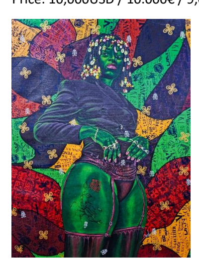
Queens of the Rings 1 – 2022 146cm H x 113cm W - Acrylic and silk screen print on canvas Price: 10,000USD / 10.000€ / 9,000pounds