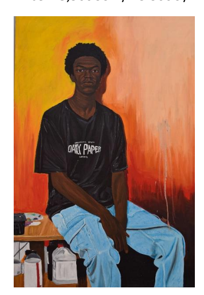
You have the Freedom now, but you are not using it – 2022 175cm H x 122cm W – Acrylic and oil on canvas

Price: 15,500USD / 15.050€ / 14,000pounds