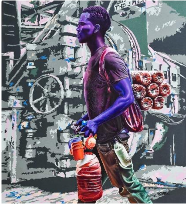
Kin Kin 2 – 2022 – 119cm H x 109cm W - Acrylic on canvas – Price: 9,000USD (ON HOLD)