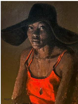
Feeling III , 2022