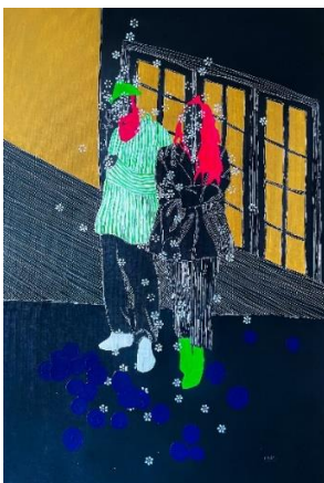
La Symphonie , 2022 150cm H x 100cm W - Acrylic on canvas Price: 6,500USD

Through his work, Moustapha explores and conceptualises his very own idealised and idyllic contemporary world, reminiscent of the golden age of the garden of eden before the fall of man. His portraits form artistic manifestations of his personal values and consciousness are informed by his progressive philosophy of humanism, which is underpinned by a calling for society to lead ethical lives, inspired by his tenets of love, joy, peace, cooperation and happiness.