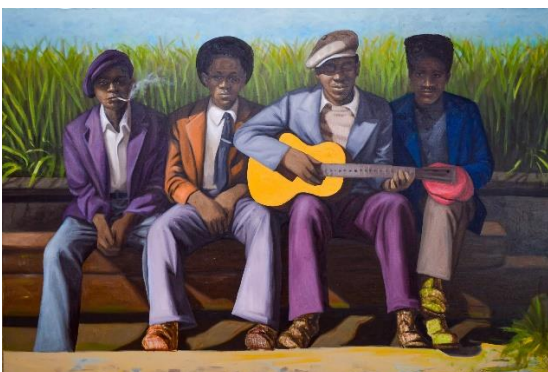
The Rejects and a Yellow Guitar, 2022 183cm H x 244cm W – Oil on canvas Price: 33,000USD