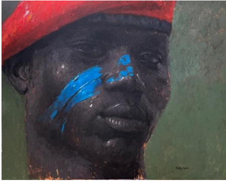
Soldier VI , 2022