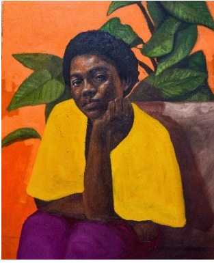
Orange isn't Blue , 2020 109cm H x 88cm W - Oil on canvas Price: 10,000USD