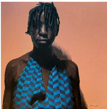
Deep II , 2022