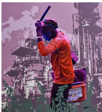
Cordonnier Obama, 2022