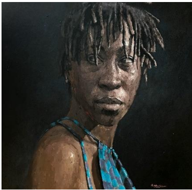
Deep III , 2022