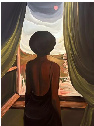
Kismet , 2022