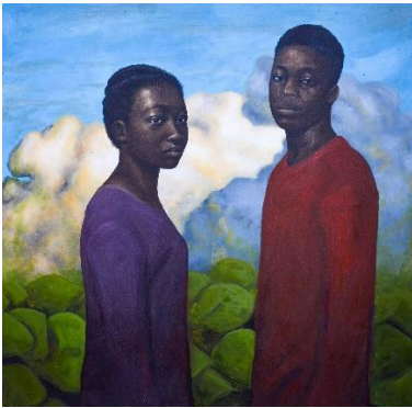
Love in a Green Heaven, 2022 122cm x 122cm – Oil on canvas Price: 14,000USD (ON HOLD)